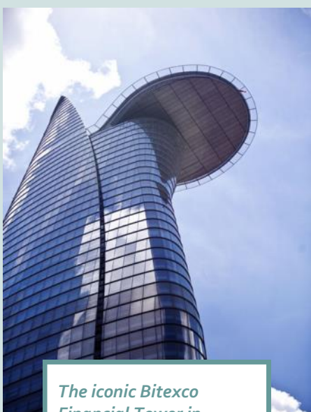
The iconic Bitexco Financial Tower in Saigon has 68 stories. We have stories too.