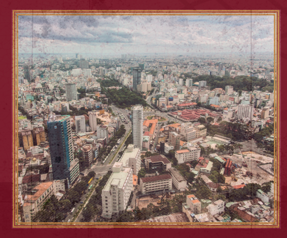
Ho Chi Minh City skyline as seen from the Bitexco Tower.

body of Christ will be planted throughout the city and multiply rapidly to God's glory.