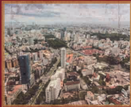
Ho Chi Minh City skyline as seen from the Bitexco Tower.