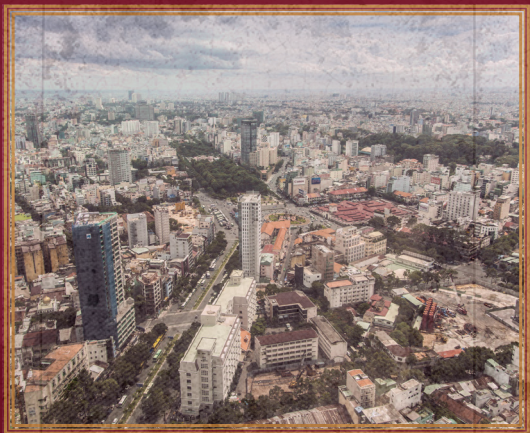
Ho Chi Minh City skyline as seen from the Bitexco Tower.