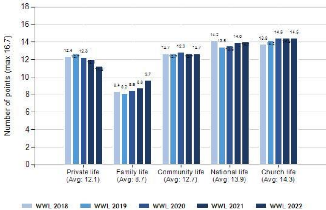
WWL 2018 - WWL 2022 Persecution Pattern for Vietnam (Spheres of life)