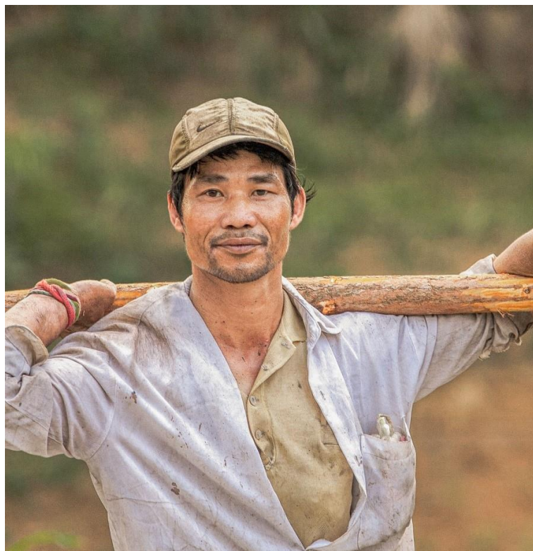
Man at work in Vietnam